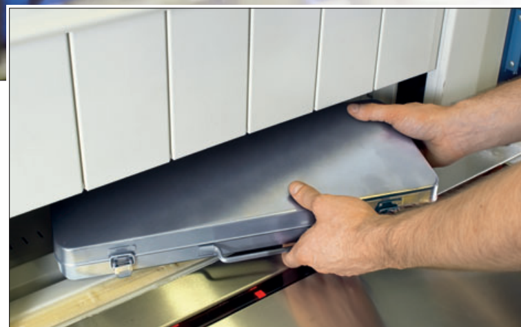
Fully automatic compartment doors for the retrieval of different-sized parts

The Hanel Lockomat is the ideal storage system for safe and secure management of tools and measuring equipment right at the heart of the production center