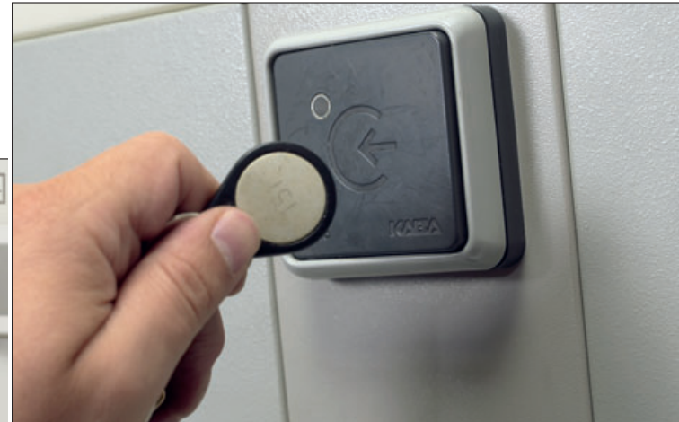
User authentication before each retrieval e.g. by transponder