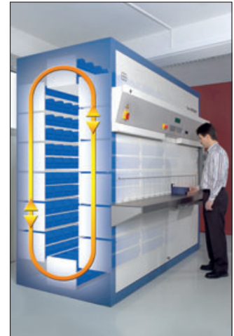
The Hanel Lockomat principle

Items can only be withdrawn after authorization is verified.