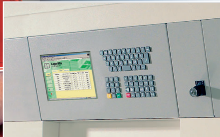
Hanel MP 12 N-S control system with TFT screen – maximum user comfort and quick integration into computer system