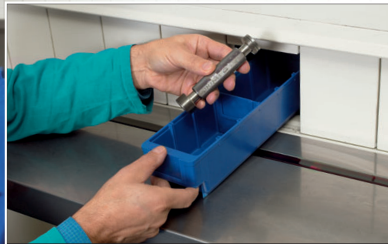
No mix-ups are possible. Only the tool requested can be withdrawn