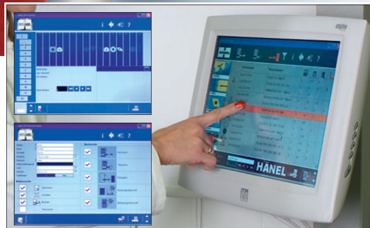
Clearly laid-out, user-friendly storage management with the Hanel TDM software using touchscreen technology