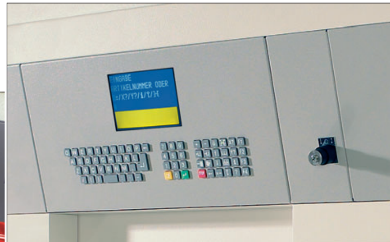
Complete storage management with the Hanel microprocessor control system MP 12 D-S